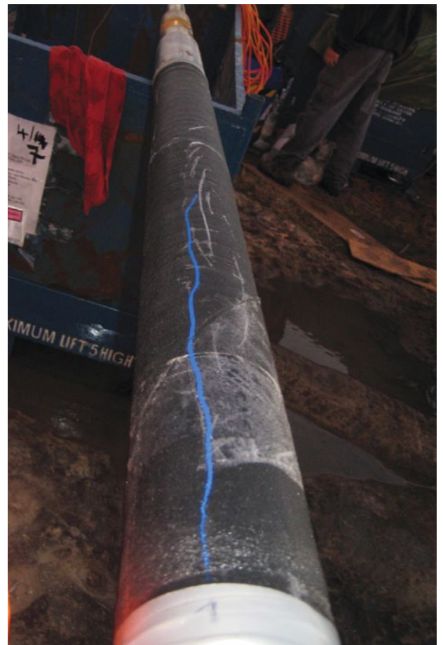
Fracture Trace on Impression Packer

In real situations the borehole may not be orientated in the direction of a principal stress and there may be